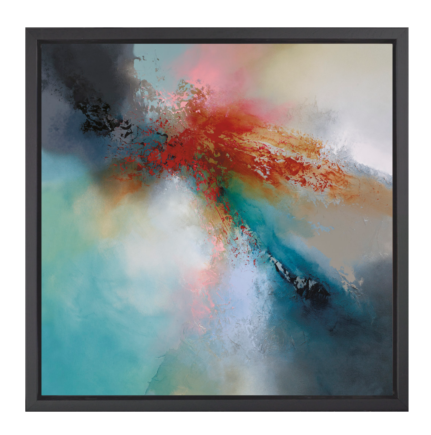
things to come